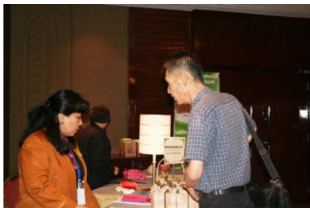
Mas Ayu Product Information