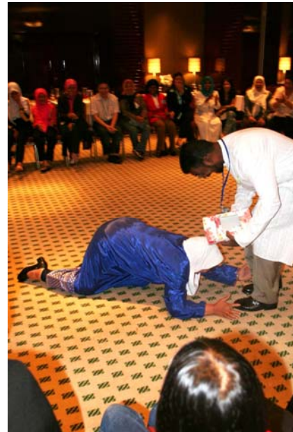
Sepatutnya kucing ...tapi nampak gaya..macam harimaulah!!!