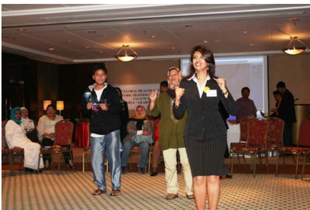
...doing the chicken dance