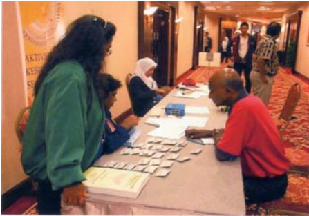
Registration of Participants