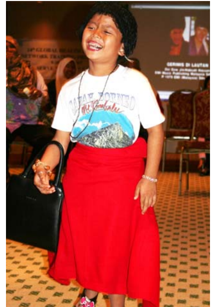
Our 'ladies' doing the catwalk