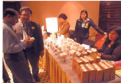
Mas Ayu Product Sales