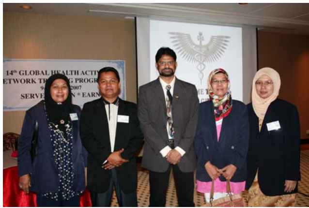
I-Get World Network Members from Terengganu