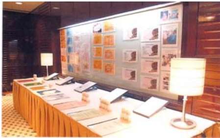
Exhibition – Mas Ayu Products for treatment of Diseases