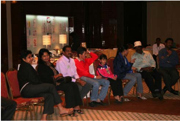
“Get-To-Know Your Neighbour”