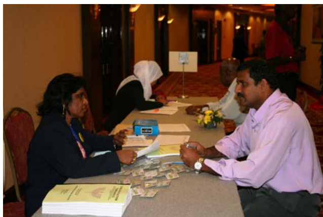
Registration of Participants