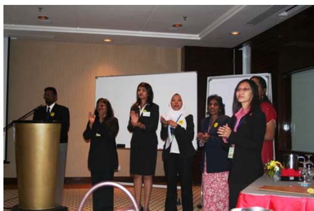
Members of the 14 th GHA Organizing Committee