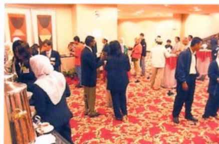
A game in progress