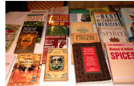
Book Exhibition & Sale