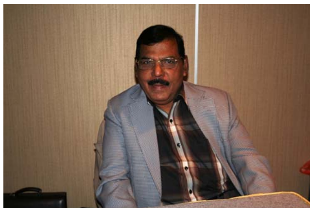
Guest of Honour – Famous Indian singer, actor & movie director, Mr M S Vasudevan popularly known as Malaysia Vasudevan.